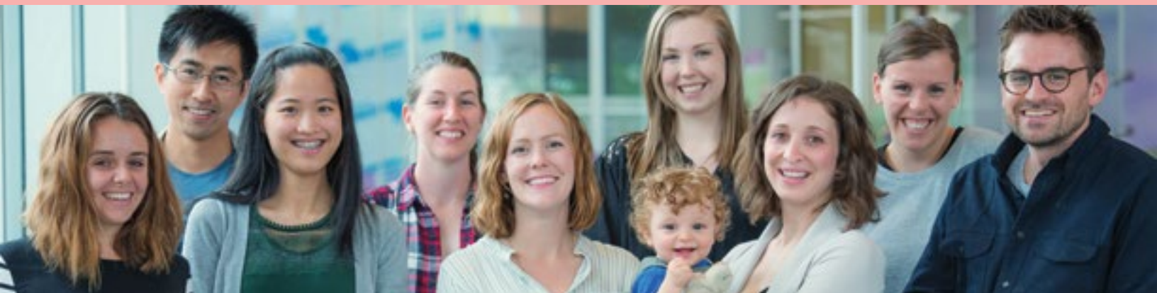
Top photo: SCI research trainee presentations at the Blusson Spinal Cord Centre.