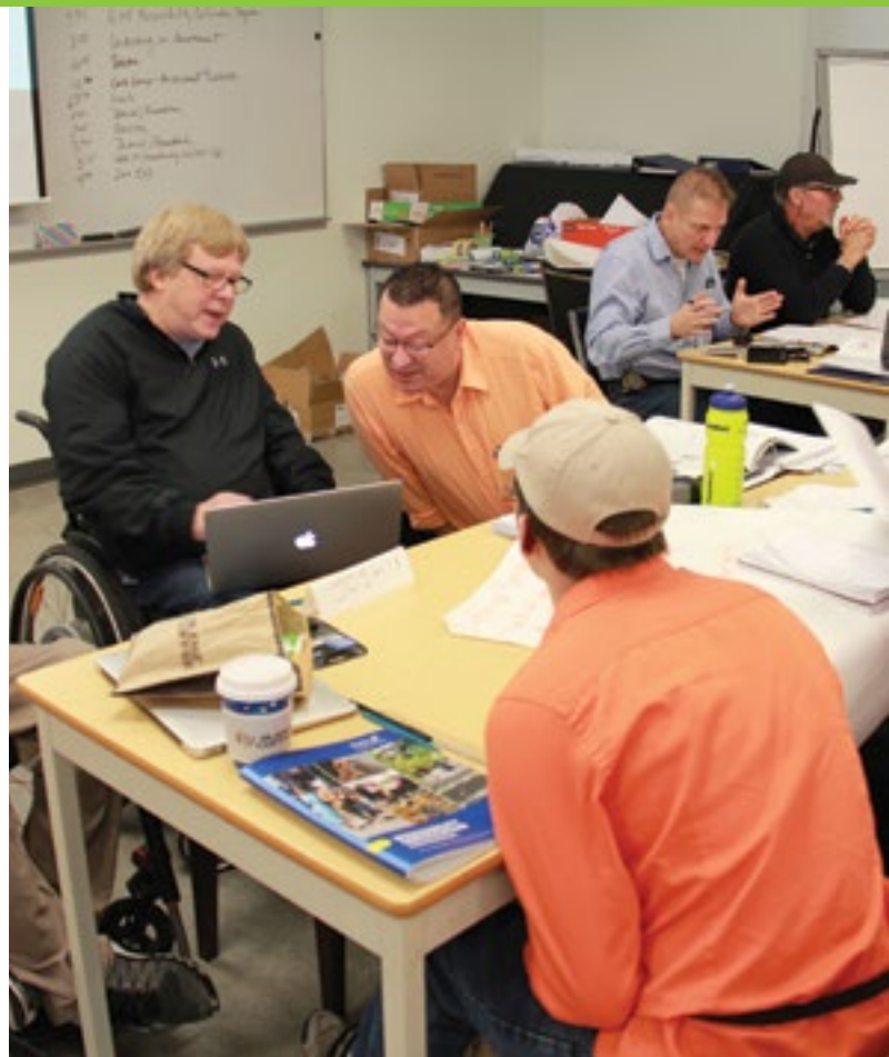
Photo: 2017 Access and Inclusion team.

“After completing the Accessibility Training, I feel like we [Access Assistants] are seeing and hearing through the eyes and ears of everyone. I look at the world now noticing the barriers, assessing buildings, and seeing all the easy fixes.”